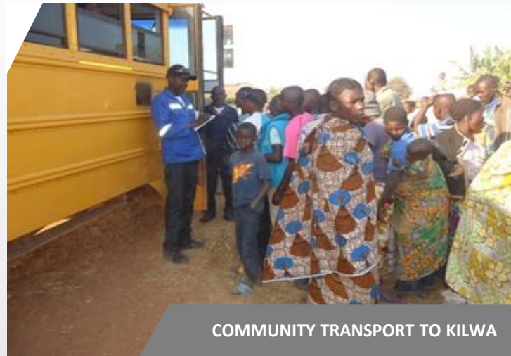
COMMUNITY TRANSPORT TO KILWA