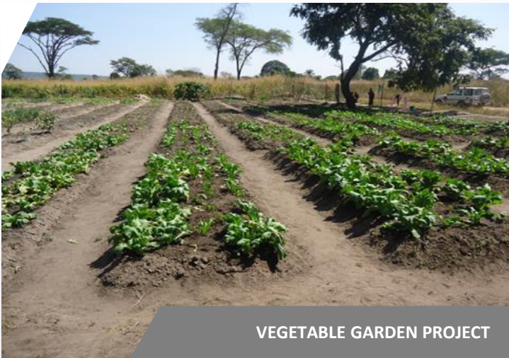
VEGETABLE GARDEN PROJECT