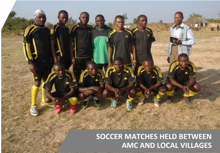
SOCCER MATCHES HELD BETWEEN AMC AND LOCAL VILLAGES