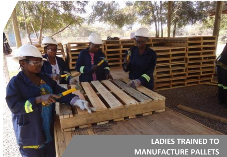
LADIES TRAINED TO MANUFACTURE PALLETS